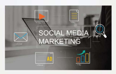
Social Media Amplification